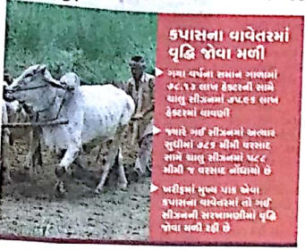
કપાસના વાવેતરમાં વૃદ્ધિ જોવા મળી

ગુજરાતના સમાજ ગણનામાં ઉપરના વાવેતરમાં મામૂલી ઘટાડો નોંધાયો છે. વરસાદની 30 ટકા ખાધ છતાં વાવેતરમાં મામૂલી ઘટાડો નોંધાયો છે. વરસાદની 30 ટકા ખાધ છતાં વાવેતરમાં મામૂલી ઘટાડો નોંધાયો છે. વરસાદની 30 ટકા ખાધ છતાં વાવેતરમાં મામૂલી ઘટાડો નોંધાયો છે.